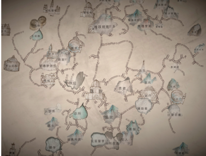
Figure 3: Examples of generated Mind Maps with topic of Imagination (left) and Hospital (right)

expansion method are involved: 1) semantic similarity, 2) linguistic feature, 3) author style and 4) Dadaist method. The detail analysis on distribution of used methods are demonstrated in the section below.