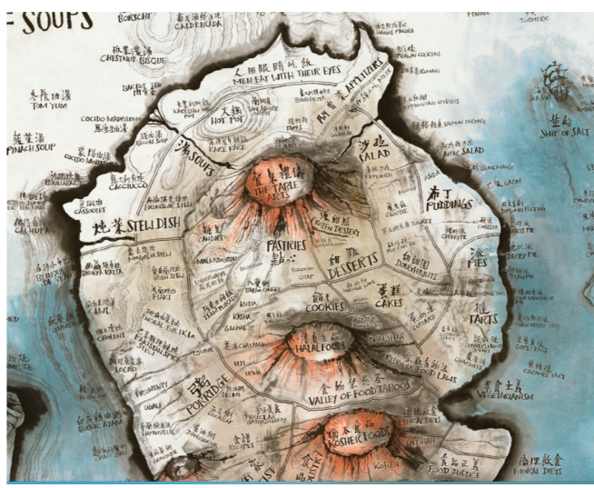
Figure 1: An example of Mind Map

Art and Technology have been interweaved in the course of human history. In Renaissance, the advancement in anatomy led to realistic and perspective depiction of human body. During industrial revolution, the development of photography steered art history away from realism to impressionism and expressionism to capture the beauty of changing nature and inner expression. Nowadays, Artificial Intelligence (AI) demonstrates stronger potential for art creation. Many researches have been conducted to involve AI into poem generation [1], [2], creation of classical or pop music [3], [4] and automatic images generation [5], [6], [7]. Whereas there are few researches exploring the possibility of artificial imagination. In this paper, we want to shed more light on if AI has imagination, and we will tackle a more challenging task: the generation of Mind Map with a given topic or idea. Firmly implanted in a scientific epistemology, the Map is viewed as a representation of knowledge. Whereas Mind Map is an artistic representation to visualize the abstract information in a figurative way (Shown in Figure 1). Sharing the same form with conventional maps, Mind Map is a special diagram which connects and arranges related words, terms and ideas around a central keyword or idea [8]. Thus, the core issue for Mind Map creation is the information expansion, that is, given a keyword or idea, how to extend it with more ideas, concepts or ontologies.