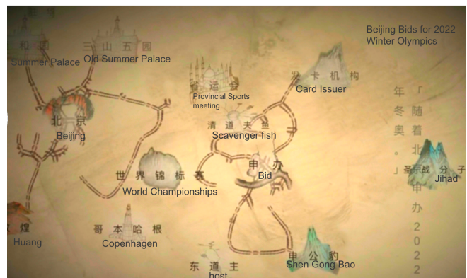
Figure 2: Screen-shot of a generated Mind Map image with voice input of Beijing Bids for 2022 Winter Olympics